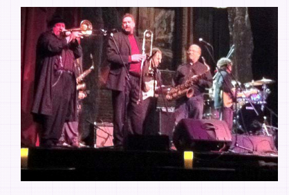
[House band the Empress]